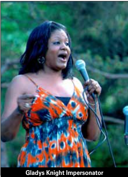
Gladys Knight Impersonator