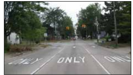
Press Conference held at City Hall, Thursday, August 5, 2010

Take the Hill: Our plan of attack is simple and direct. We plan to cut down trees, shrubs, remove trash, debris and rubbish; cut grass, vacant lots and fields; trim hedges, edge sidewalks, etc. on a block-by-block basis until every house, vacant lot and field have been addressed, leaving no stone unturned.