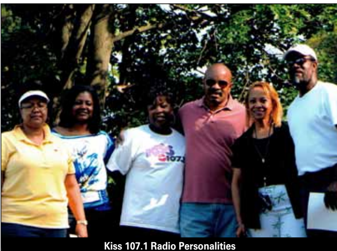
Kiss 107.1 Radio Personalities